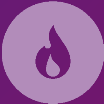
Warm cozy light