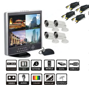
Item No.: SE-RM6245-CI341H