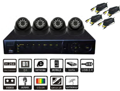
Item No.: SE-RD614H-CD342C