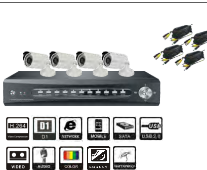
Item No.: SE-RD634D-CI341H