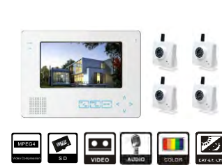
Item No.: SE-RD6047-CI311Q