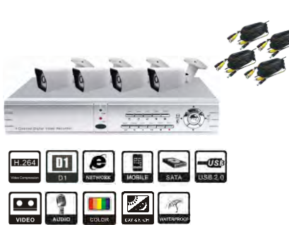
Item No.: SE-RD624V-CI142V