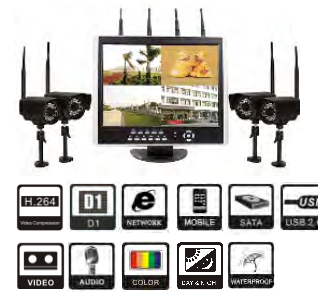
Item No.: SE-RD6345-CI132I